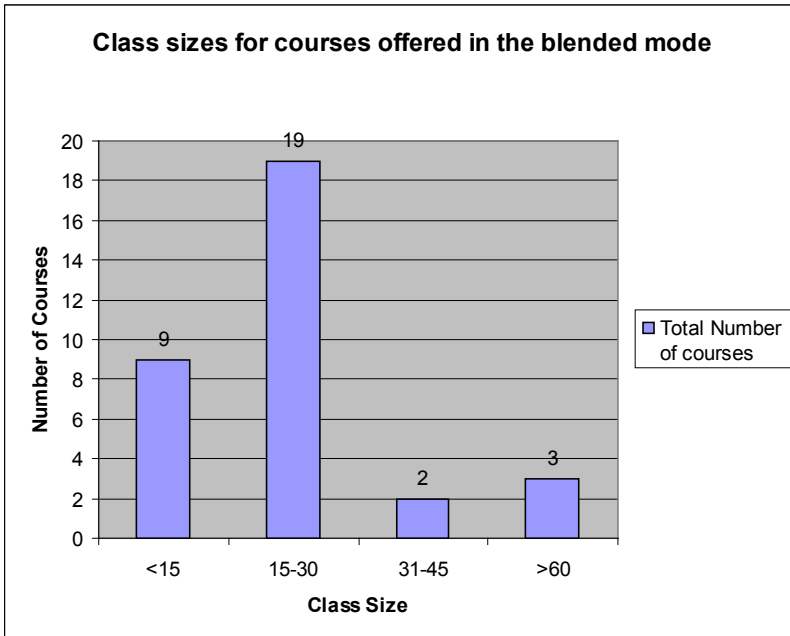
Table 1: Comparison between faculty who use e-learning per school and number of students per school

This disparity could be due to large class sizes and inadequate facilities. When users of e-learning were asked about their class sizes, it was noted that though there is an increase in the use of e-learning, e-learning is mainly used in class sizes of 15-30, see Chart 1 below.