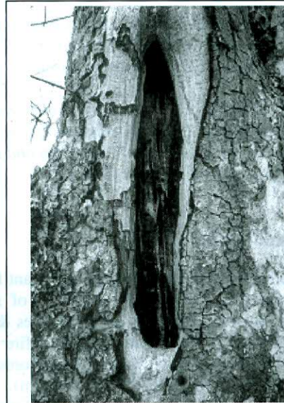
Figure 2: Fire lesion on trunk of S. rautanenii tree showing vertical splitting, charring and cavity development

During a field visit to a stand of S. rautanenii trees it became evident that many trees have multiple trunks, joined at the base. As the crown carried by such trunks grows progressively heavier, the trunk starts to develop vertical checks and splitting, (see Figure 2). Once a certain mass threshold is exceeded, the trunk breaks off from the remaining tree and collapses. This is clear from Figure 3, showing the opposite side of the trunk in Figure 2.