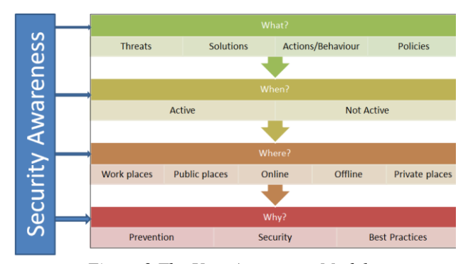
Figure 2. The User Awareness Model